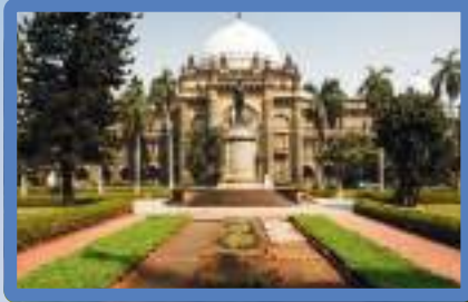
Chhatrapati Shivaji Maharaj Vastu Sangrahalaya