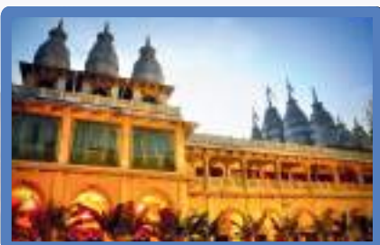
ISKCON Temple, Juhu