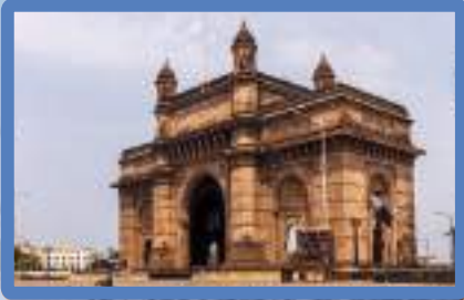
Gateway of India