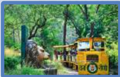
Sanjay Gandhi National Park