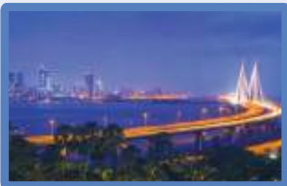
Bandra Worli Sea Link Bridge