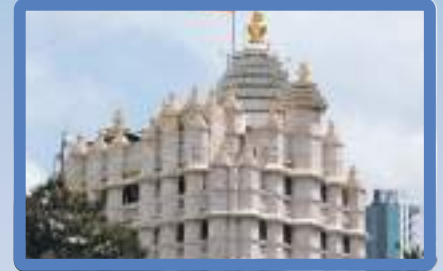
Shree Siddhivinayak Temple