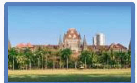
High Court of Bombay